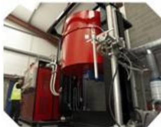
ENVA Carryduff Distillation Plant

We currently take in waste thinners, solvent, paint sludge and mixed fuels from Enva.